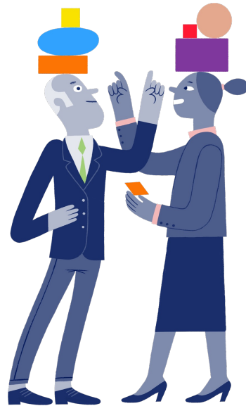
2. Recognize what other people do, say, and show