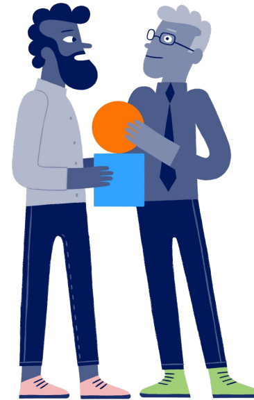
3. Adapt your communication style