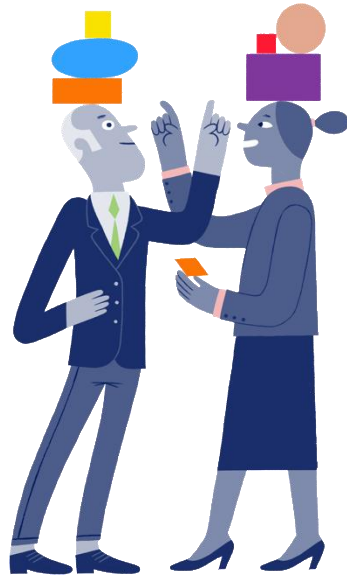
2. Recognize what other people do, say, and show