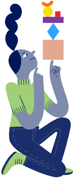
1. Be Aware of your personality