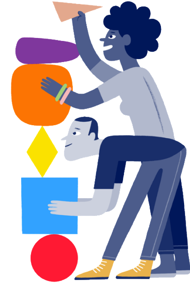
4. Build better relationships